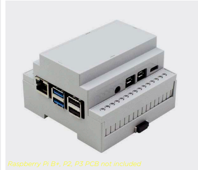
Raspberry Pi B+, P2, P3 PCB not included