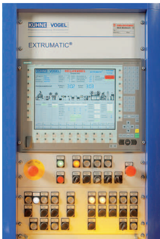
Standardised process control and visualisation of an extrusion system at our Windsbach factory.

Dimensions and specifications may be changed without prior notice. (RB01)