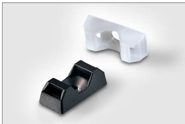
Q-Mount, CTQM 2-way entry, screwable.